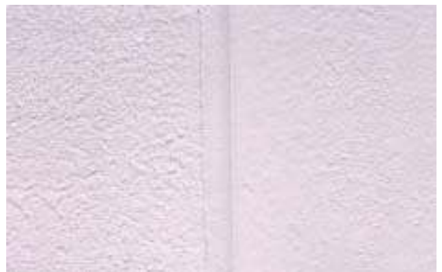
View of the finished joint. It can be painted with the desired colour