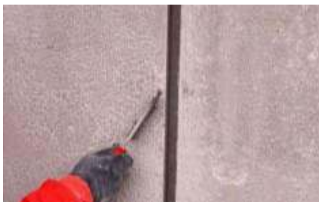
Preparation and cleaning of joint