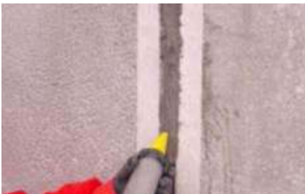
Application of MAXJOINT ELASTIC

For any other issues, consult our Technical Department.